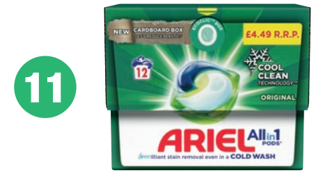
ARIEL ALL IN 1 PODS PM £4.49 12 PODS SKU CODE: 807982

VANISH OXI ADVANCE PM £4.79 470G SKU CODE: 715366