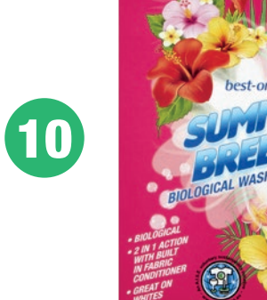
BEST-ONE SUMMER BREEZE POWDER PM £1.39 13 WASH SKU CODE: 786080

COMFORT CONCENTRATE BLUE SKIES PM £1.99 750ML SKU CODE: 655899